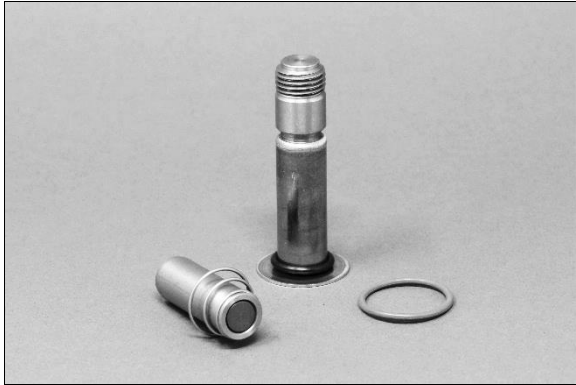
Typical Direct Acting Valve Rebuild Kit