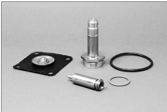
Typical Diaphragm Valve Rebuild Kit